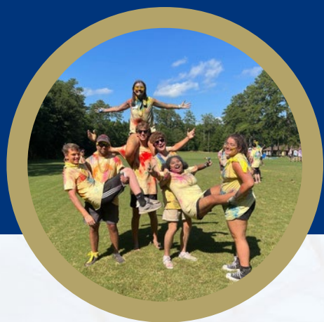
2 Programs Offered