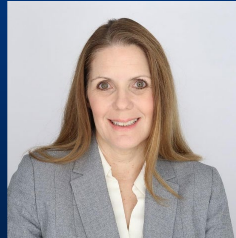
Director of Academic Advising Operations and Engagement