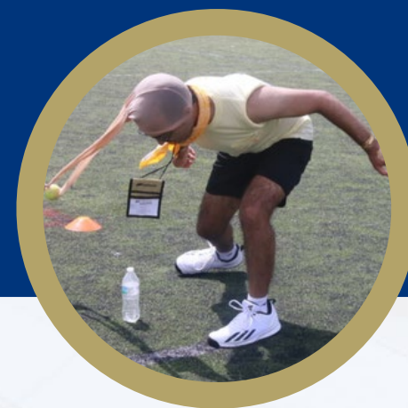
WRECK Camp Games!