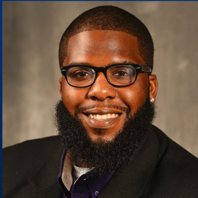
Asst. Dean and Director (NSTP)